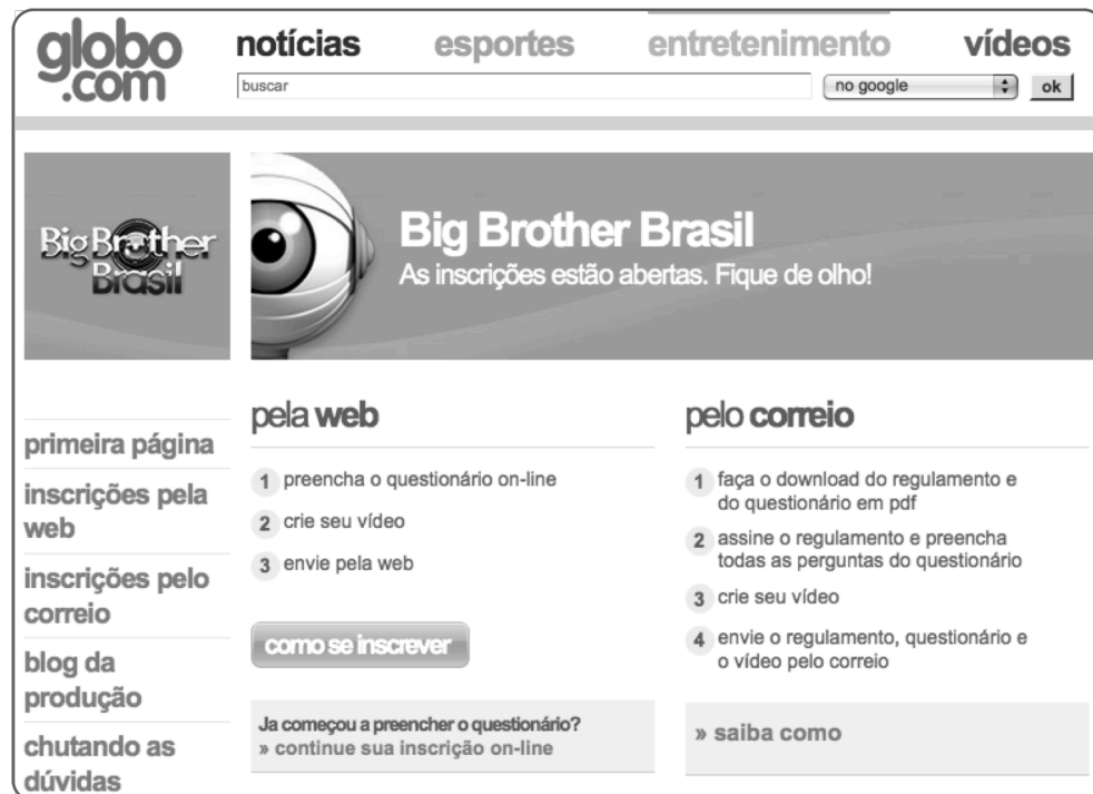
Figure 3.4. Big Brother Brasil's official web page.

To begin the submission process the user needs to create an account in the reality show's [BBB 10] website.